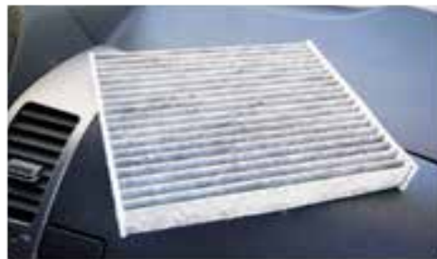
Car Aircon Filters