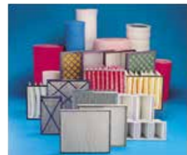
Commercial AHU Filters