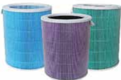
Air Purifier Filters