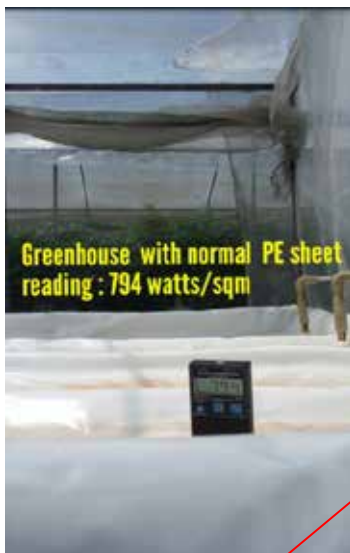
70% Reduction in heat watts/sqm