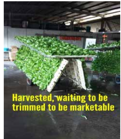
30% higher vegetable yield