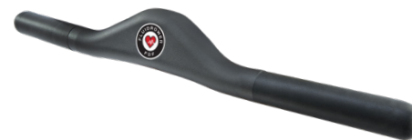
TOUCH HEART RATE HANDLE