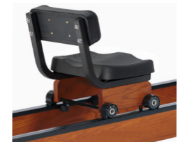
SEAT BACK KIT